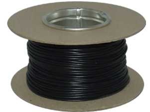
Non-Tinned Cable 734105-A

For the harsher marine environments, the ASAP Electrical Tinned Thin Wall Cable (part numbers starting with 748) is the preferred option. Tinned cable offers all the benefits of the non tinned thin wall cable but with an extra benefit of the tinning process. The tinning process fills the voids between conductors, leaving no air space for the condensation to accumulate. This gives a lot better resistance against the harsh marine environments and prevents deterioration.