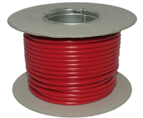
Tinned Cable 748193-K