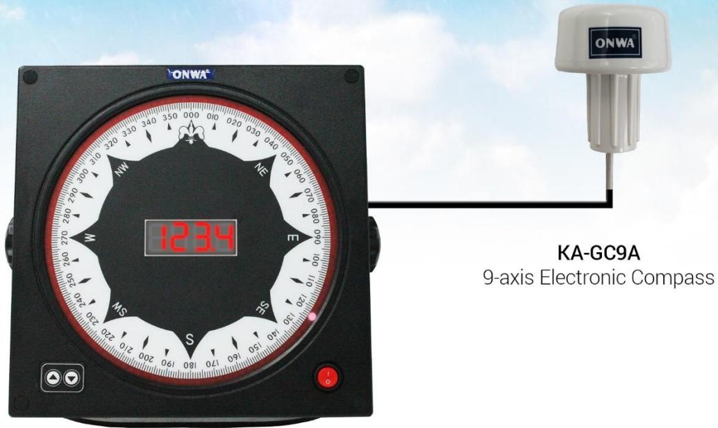
KCR-160 Digital Compass Repeater